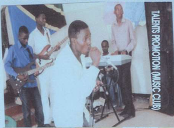
TALENTS PROMOTION (MUSIC CLUB)