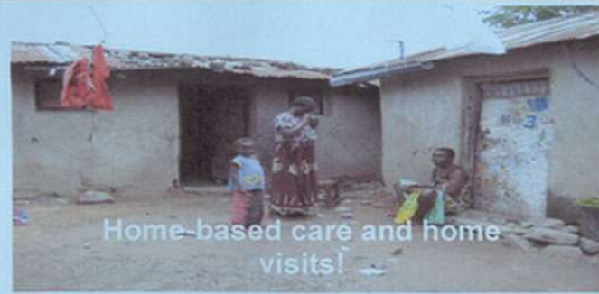
Home-based care and home visits!

SHALOOM CARE HOUSE HEALTH DEPARTMENT ARCHDIOCESE OF MWANZA