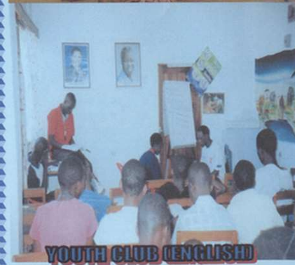
YOUTH CLUB (ENGLISH)